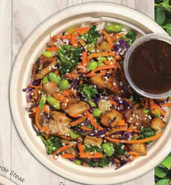
Chile Verde Steak